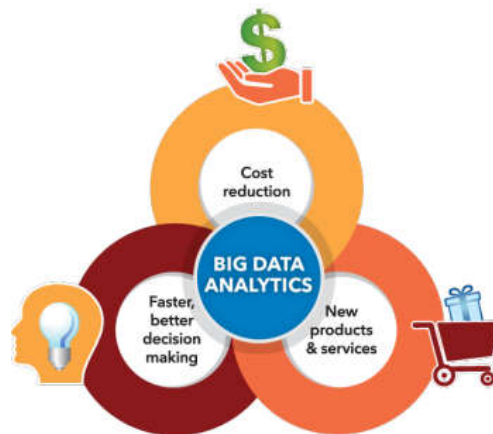
Fig 2: Source of Big Data

New products and services: The ability to gauge customer needs and satisfaction through analytics comes the power to give customers what they want. Davenport points out that with big data analytics, more companies are creating new products to meet customers' needs.